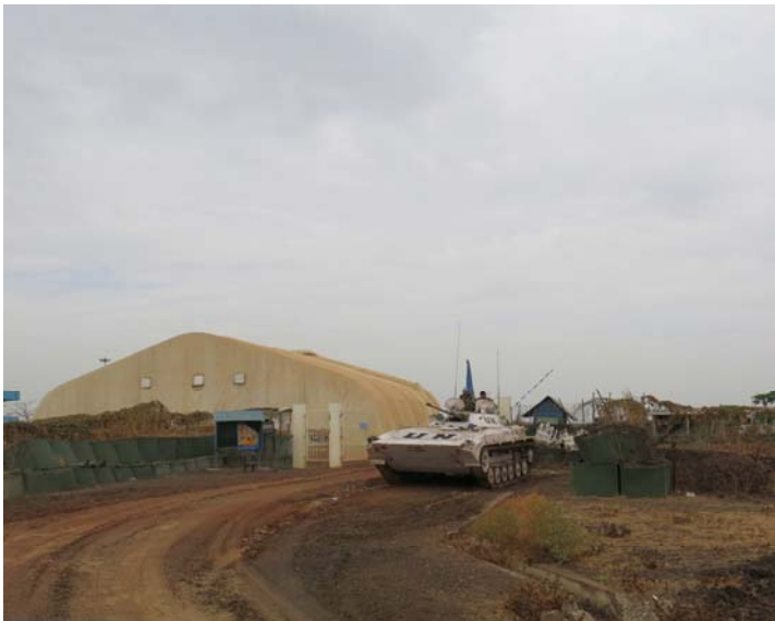
UNMISS armoured vehicle at the base where residents displaced by the conflict are sheltering in Malakal

UNMISS is providing sanctuary for some 80,000, of the 950,000 who are currently internally displaced by the conflict. 74 They are sheltering in the protection sites of eight UNMISS compounds across the country, and many of them are too afraid to venture beyond the gates. In offering sanctuary and providing protection for these individuals, the Mission has undoubtedly saved many lives. Yet it has found itself in an unprecedented situation and in a role for which it was not prepared. The Mission had envisaged perhaps being called upon to provide a temporary safe-haven during intense conflict, after which civilians would return to their homes. But now, several months into the conflict, civilians have not left and more continue to seek refuge in UNMISS protection sites that are not designed to host such large numbers of people over long periods of time. There are, in addition, serious security concerns. Civilians and armed actors seem oblivious to the protections accorded under international humanitarian law to places of sanctuary, to UN peacekeepers, and to peacekeeping bases.