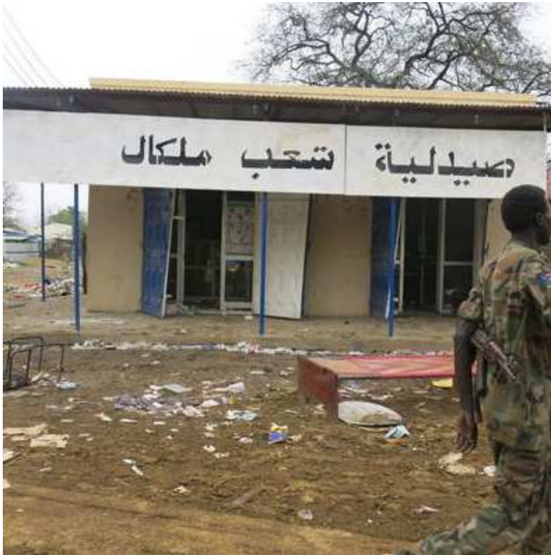
Armed opposition fighters outside Malakal Hospital