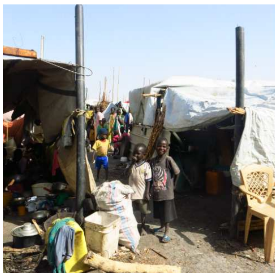
Malakal IDP camp where thousands live in dire conditions, March 2014.

UNMISS peacekeepers are currently conducting patrols around the immediate vicinity of the protection sites. They should increase patrols and extend them farther to both to better ensure the safety of those within the protection sites and as well as to improve security for those who wish to venture outside, or leave. The Mission should provide escorts to those who need to move beyond the perimeter of the protection site for essential purposes. According to UNMISS, the delays in the arrival of troops have so far constrained the Mission's ability to extend patrols. 79