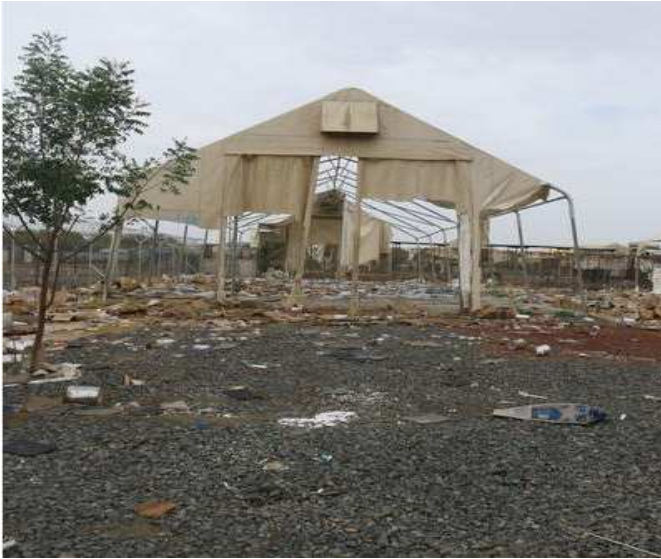
WFP food store in Malakal looted and trashed; the looting and destruction has worsened an already severe food crisis.

World Food Programme (WFP) warehouses in Malakal were completely looted and destroyed in January, when opposition forces gained control of the town. Civilians participated in the looting, accelerating the speed and scale at which properties were taken. Food supplies sufficient to feed 400,000 people for three months were reportedly looted in less than three days. In the surrounding areas, Amnesty International delegates saw scattered empty tins of oil—all that remained.