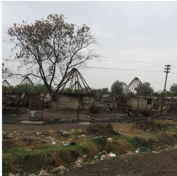
Burned down homes in Malakal

When Amnesty International visited the town from 10 to 14 March, it was under the control of opposition forces. Much of the town lay in ruins, with homes and other property looted and burned down. The entire civilian population had fled, with only a few individuals connected to opposition fighters remaining in town. Some 21,000 people, mostly Shilluk and Dinka and a smaller number of Nuer, were sheltering in the protection site of the UNMISS base at the edge of town. The rest had fled to surrounding rural areas and farther afield. Large numbers of Nuer had reportedly gone to the opposition stronghold of Nasir to the south-east.