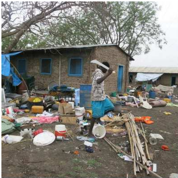
Compound of Christ The King Church in Malakal