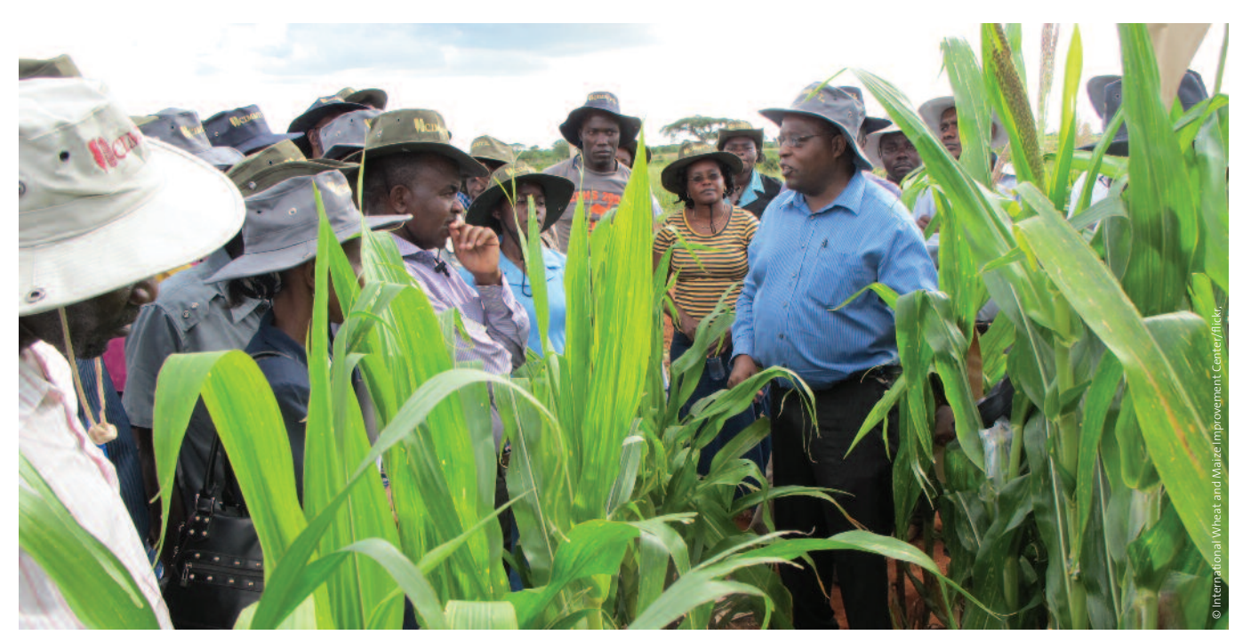
Principal scientist and maize breeder at CIMMYT Global Maize Program and coordinator of the Insect Resistant Maize for Africa (IRMA) and Water Efficient Maize for Africa (WEMA) projects, explains the process of effective nursery pollination to the trainees at the CIMMYT/KARI (Kenya Agricultural Research Institute) research station in Kiboko, Kenya.