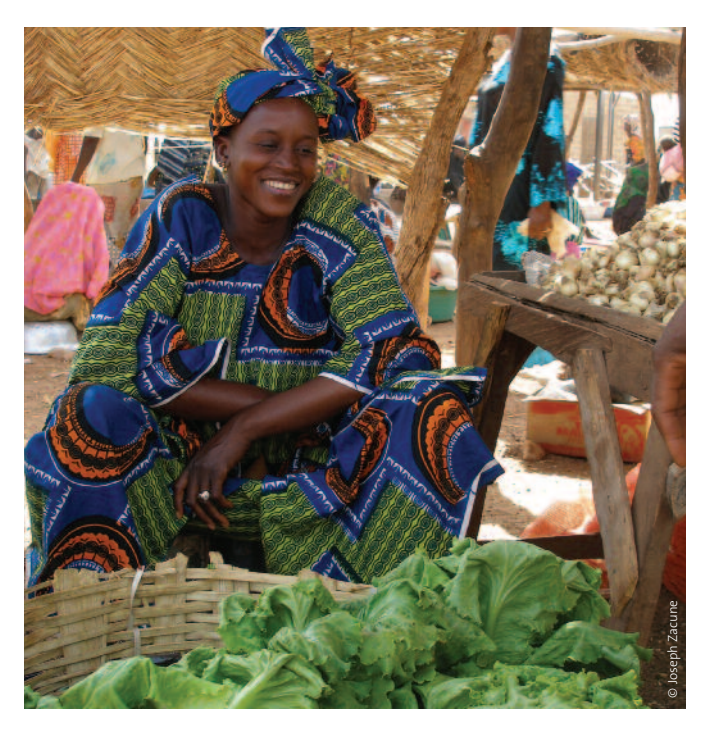
A woman at a market in Ghana.

Africa Agriculture Development Programme, http://tcoe.org.za/component/content/article/39-featured-articles/176-do-africanfarmers-need-the-caadp.html