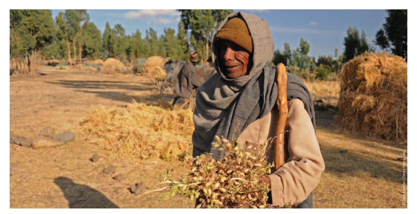
An Ethiopian farmer shows his chickpea plant harvest.

To date, only one regional harmonisation effort, undertaken by the Common Market for Eastern and Southern Africa (COMESA), has made sufficient progress toward becoming an operational reality.<sup>70</sup> The only other REC to have undertaken significant work on regional harmonisation is the Economic Community of West African States (ECOWAS). However, it would seem that lingering ties to the values underpinning the African Model Law on Biosafety are still creating obstacles and frustrations for donors such as USAID, and have effectively stymied the process in this region for now.