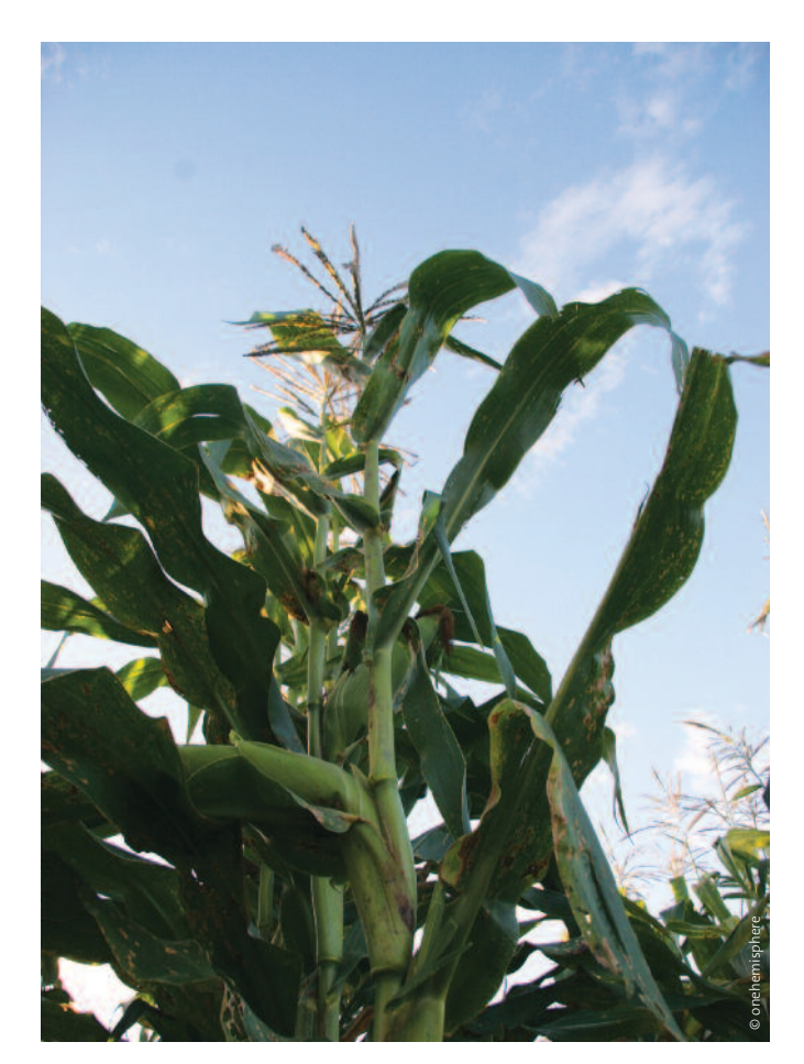
Maize growing in Lesotho.